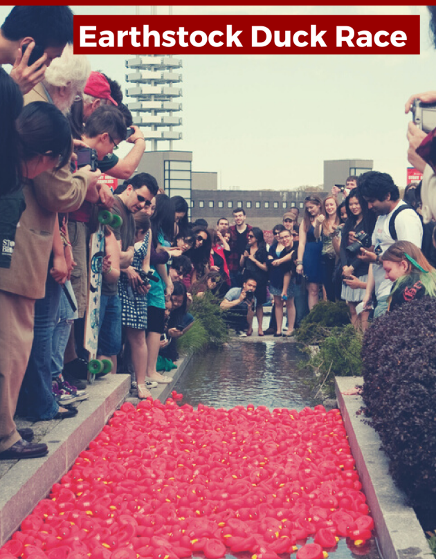
Earthstock Duck Race