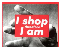
Barbara Kruger, 1987

After the destruction of the World Trade Center towers in 2001, the President of the United States sought to