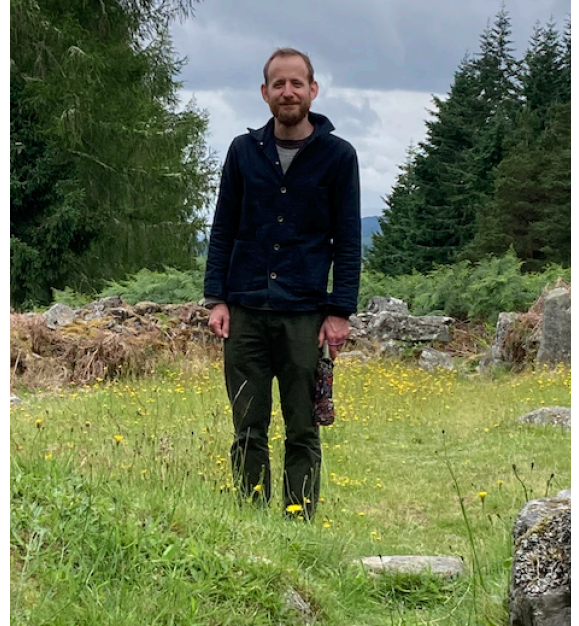
Standing in a Pictish ring fort in the Allean Forest, Scotland.