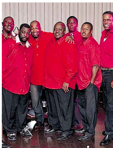
EWTF TRIBUTE BAND

The band Earth, Wind and Fire had many hits between 1973 and 1981. And you can hear 30 of them performed by The Earth Wind and Fire Tribute Band 70s Funk, 8 p.m. Saturday at the Suffolk Theater in Riverhead. Admission is $30, 631-727-4343, suffolktheater.com