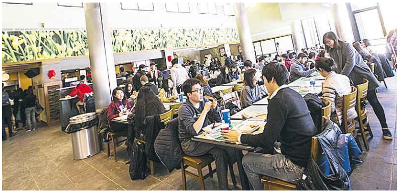
The Jasmine Tea House, on the second floor of the Wang Center, is usually open until 8 p.m. every day, but hours vary during school breaks.