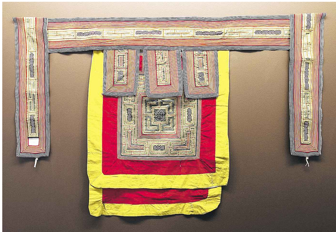
A Miao baby carrier, considered an heirloom, on view at Stony Brook University's Charles B. Wang Center.