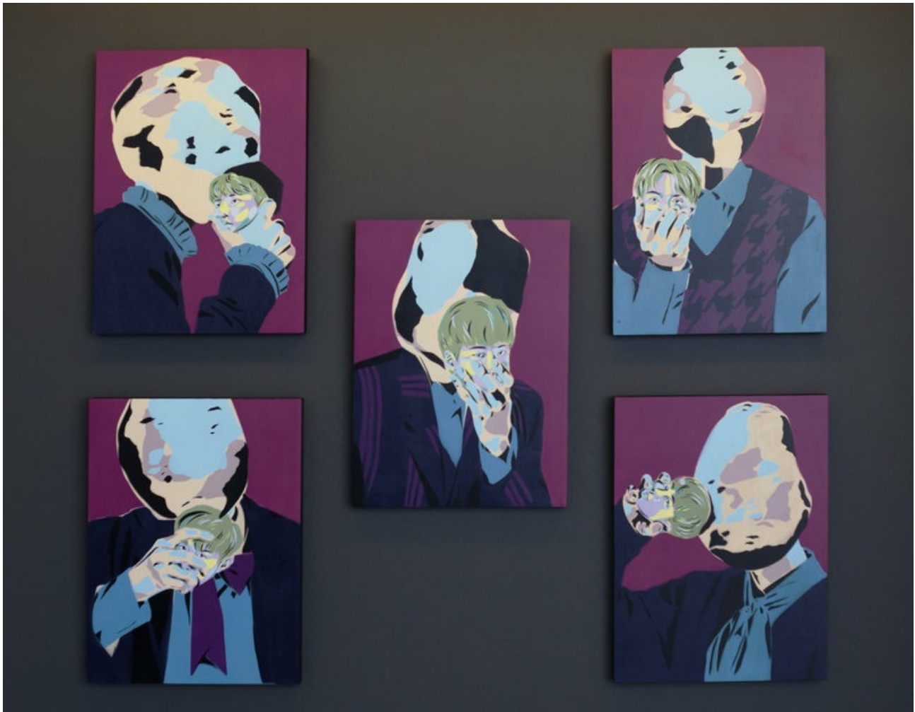
K-pop idols become potatoes, and vice-versa.