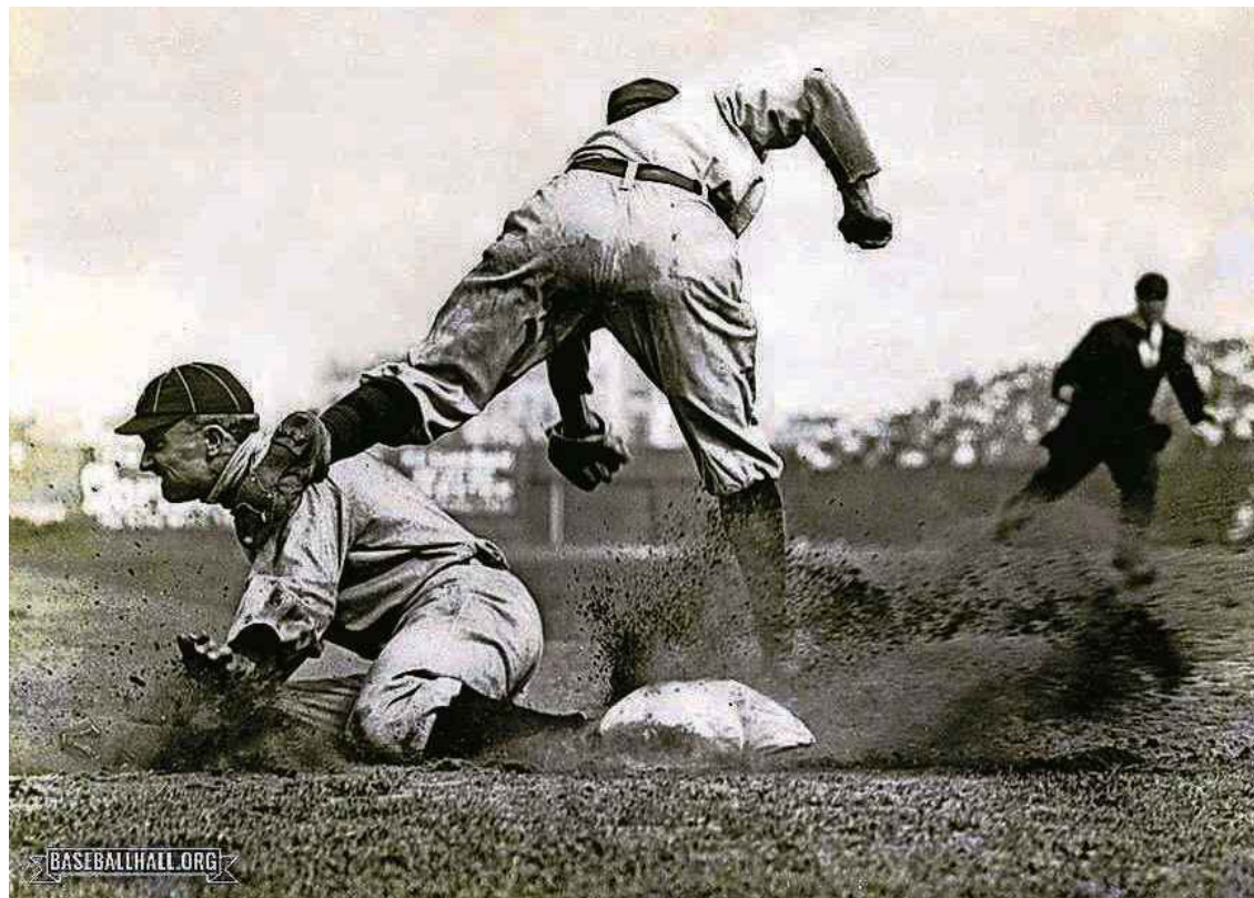
The Long Island Museum’s “Picturing America’s Pastime” includes iconic photos like this 1910 image of a slide by Ty Cobb.

Fly a drone, chart the heavens, discover Latinx aviators and dress up as your favorite scientist for “Spooky Science Night” on Oct. 27. They’re all one-of-a-kind experiences connected to Long Island’s unique spot in history, and they’re all here. You can also follow a mother whale and her newborn calf’s journey or discover the cosmology of the Inca and Mapuche peoples of South America at the Catholic Health Sky Theater Planetarium. More info: Check website for planetarium and gallery admission; 516-572-4111, cradleofaviation.org