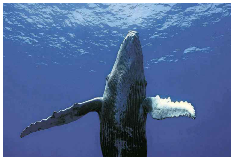
A still from the new film “Ocean Odyssey” at the Cradle of Aviation.

“Suffolk County: A Timeline Experience” permanent exhibition, Suffolk County Historical Society Museum, 300 W. Main St., Riverhead So you think you know about life on Long Island? This new “museum within the museum” is ready to test and expand your knowledge. A time-